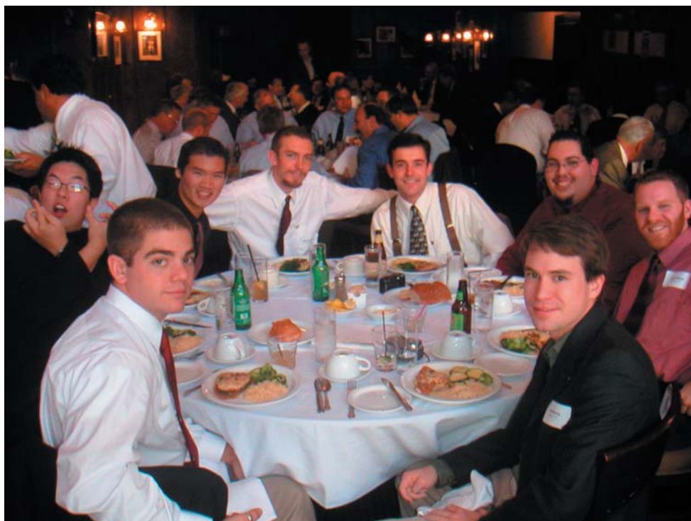
California Beta alumni and undergraduate brothers enjoy the annual Big Game Luncheon

School is upon us once again, and the 48 undergraduate brothers of the California Beta chapter of Phi Kappa Psi have returned to our home at 592 Mayfield for another year of brotherhood, community service and fun. With 18 newly-initiated brothers joining the active ranks, the chapter has been reinvigorated and is quickly moving in new directions.