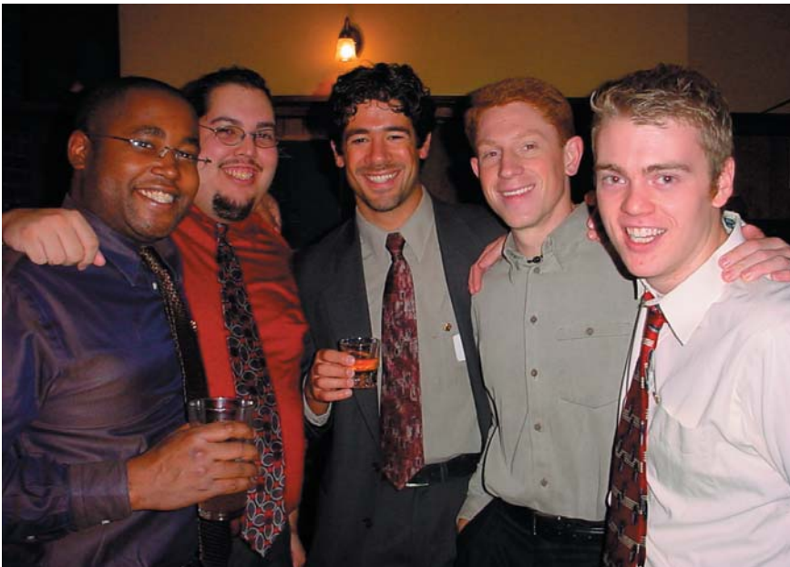
California Beta alumni brothers gather at the house for Homecoming '03